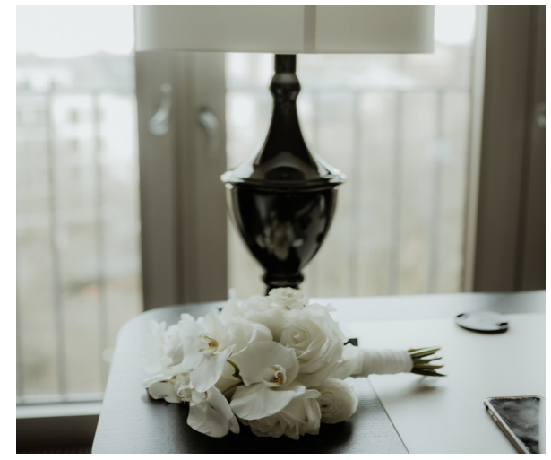
\ensuremath{\text{@}} Glück ^2 - Hochzeiten by Selina & Luisa

Sofitel Frankfurt Opera, located opposite the Old Opera, features timeless architecture inspired by 17th-and 18th-century grand French townhouses. The hotel is just moments away from the city center, financial district, and luxury shopping.