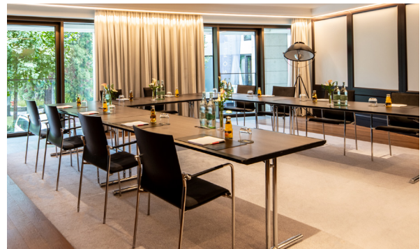
Île Saint Louis Meeting Room

Our dedicated Events team will handle every detail, from cuisine to décor, ensuring your event is unforgettable.