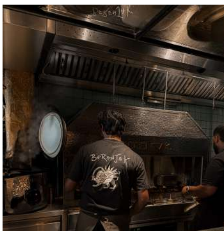
Berenjak Borough www.berenjak.com

If you're after something a little different, Berenjak Borough is a standout. It's the kind of place you come for dinner and leave already planning your return. For lovers of fire-cooked meats and vibrant Middle Eastern flavours, this is a London gem not to be missed.