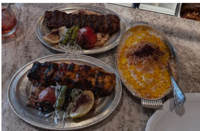
Koobideh Kabab, Jujeh Kabab, Saffron Rice www.berenjak.com