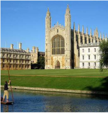
University of Cambridge - www.cam.ac.uk

King Charles, Oliver Cromwell, Mahatma Ghandi, Sir Isaac Newton - pioneers who were shaped by the incredible town of Cambridge - this private tour will take you down the same quaint and narrow passageways that Royalty, heads of state, artists, writers and scientists have walked before. We will tap into their genius and discover their world-changing visions and moments that happened here at Cambridge.