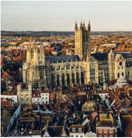
Canterbury - www.canterbury.co.uk

From the very beginning to what could have been the very end – follow the history of a Great Britain in and out of war and invasion for the last millennia as you explore Dover and Canterbury. A private guide and separate chauffeur driver will pick you up at The Savoy and take you to the iconic seaside town of Dover. We will take you to the breath-taking White Cliffs for a scenic walk, we will see the immense Dover Castle down below which is steeped in military history and enjoy a walk along the beach which holds view of Normandy/France (weather permitting).