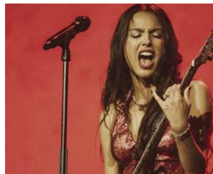
American Express Presents BST Hyde Park - Olivia Rodrigo www.bst-hydepark.com

American Express BST Hyde Park: Zach Bryan Hyde Park