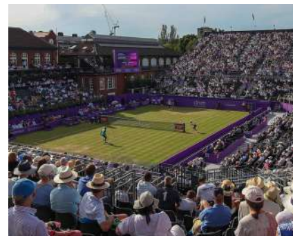
Queen's Club Championships - www.queensclub.co.uk

Tennis: Wimbledon Championships All England Lawn Tennis and Croquet Club