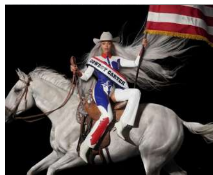
Beyoncé: Cowboy Carter Tour - www.beyonce.com/

Rauw Alejandro: Cosa Nuestra Tour The 02 Arena