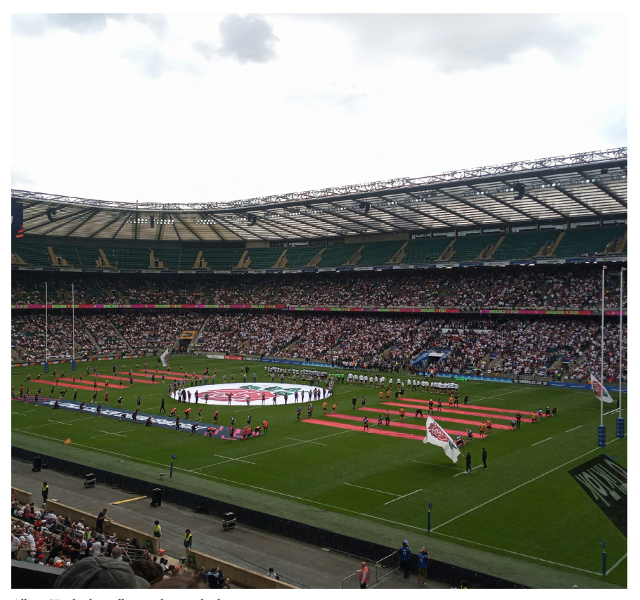
Allianz\ Twicken ham\ allianz stadium twicken ham.com