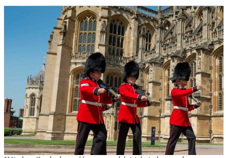
Windsor Castle -https://www.rct.uk/visit/windsor-castle