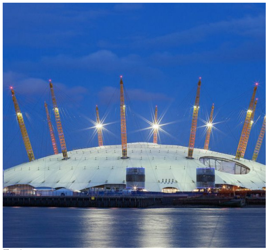
The 02 Arena www.02.com