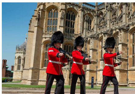
Windsor Castle - https://www.rct.uk/visit/windsor-castle

This wonderful day out will introduce you to the Royal Town of Windsor - its beauty, majesty and legendary status as the capital of Royalty in Britain. Your day will begin with a tour of Windsor Castle - the oldest and largest occupied castle in the land. Nearly 1,000 years old, built by William the Conqueror, the castle has played a key role in the Royal dynasty for generations. On this tour we will show you the castle precincts, the chapel (the location of the recent Royal weddings and HM Queen Elizabeth II's final resting place) and the incredible State Apartments - the personal rooms of the Royal family, as well as the famous Queen Mary Doll's House. Please note that no guiding is permitted in the State Apartments, but your guide will escort you in and point you towards clerks who can give you more information. The guide will share with you stories of the staff that maintain the castle, their relationship with the Royals and the famous Monarchs who inhabited the castle over the centuries.