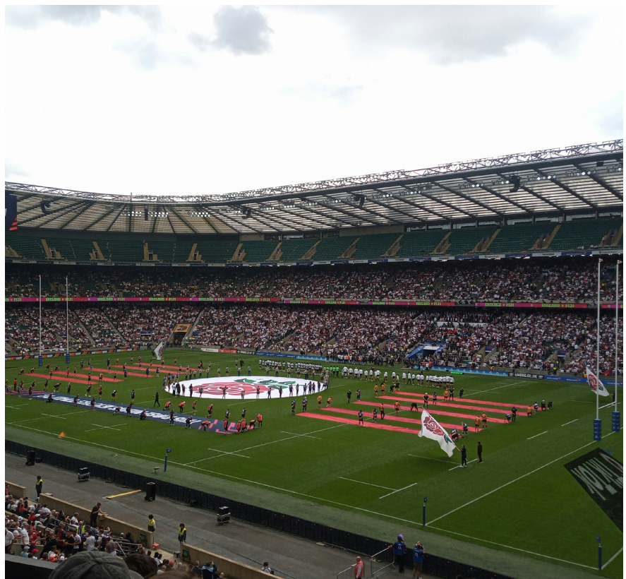
Allianz Twickenham allianzstadiumtwickenham.com