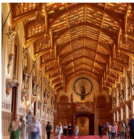
Windsor Castle - https://www.rct.uk/visit/windsor-castle