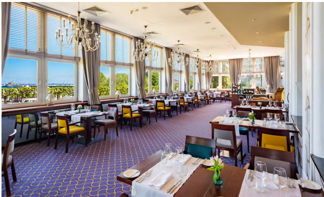
Grand Blue Restaurant

Discover this stunning address at Baltic coast where monumental style blends seamlessly with French art de vivre.