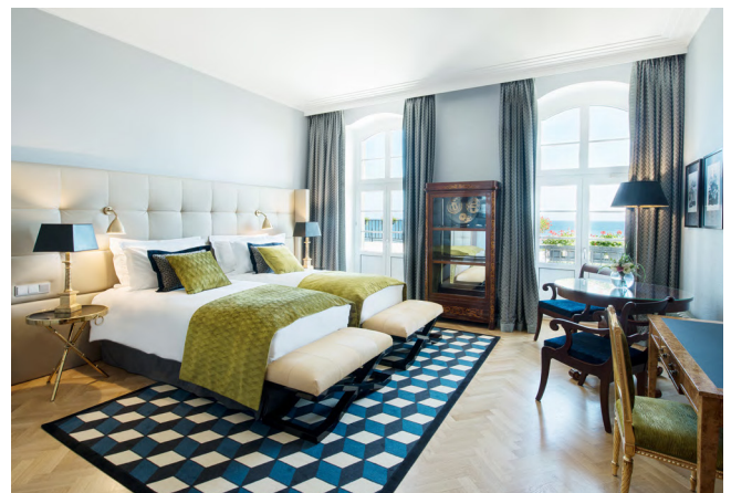
Charles de Gaulle Presidential Suite