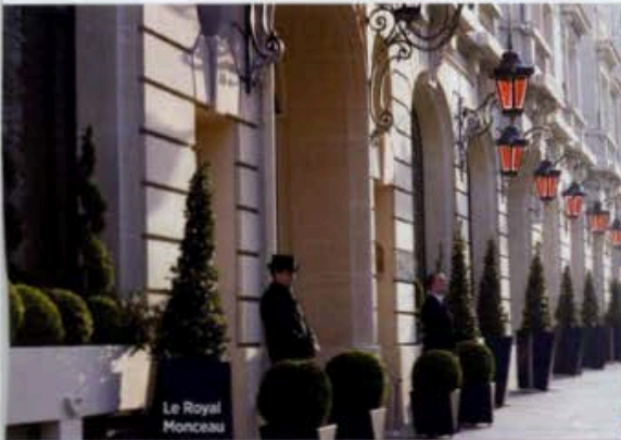
Le Royal Monceau