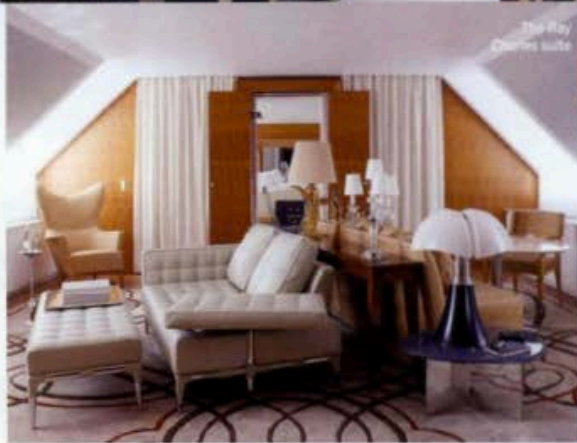
The Royal Monceau's lounge

THE PARC MONCEAU, WITH ITS WEEPING WILLOWS, CRUMBLING PYRAMID AND CLASSICAL COLONNADE, IS UTTERLY PICTURESQUE ON A SUMMER'S DAY