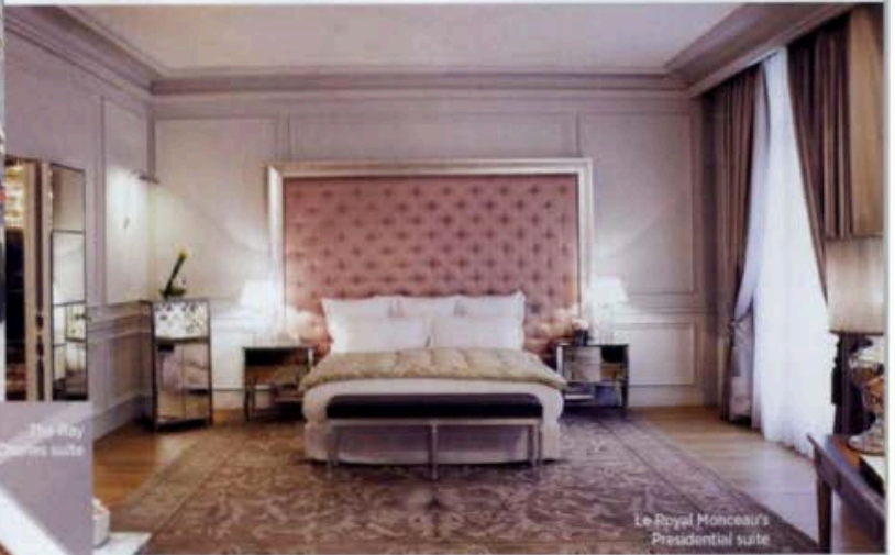
Le Royal Monceau's Presidential suite