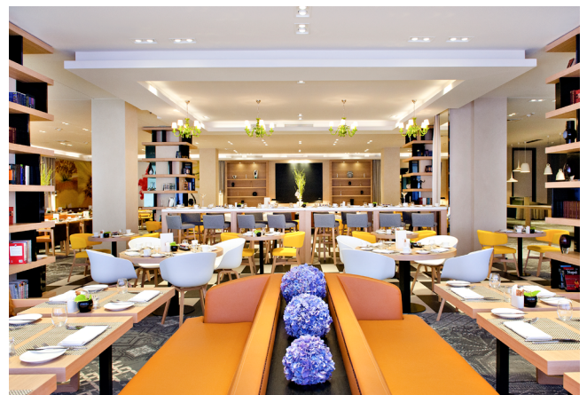
Kitchen Gallery restaurant

Relaxation and signature cocktails with a magnificent view of Pilsudski Square.